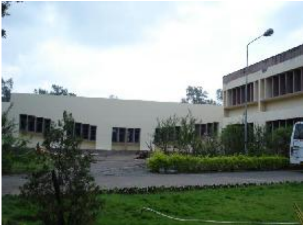
Extension of ACHF Building