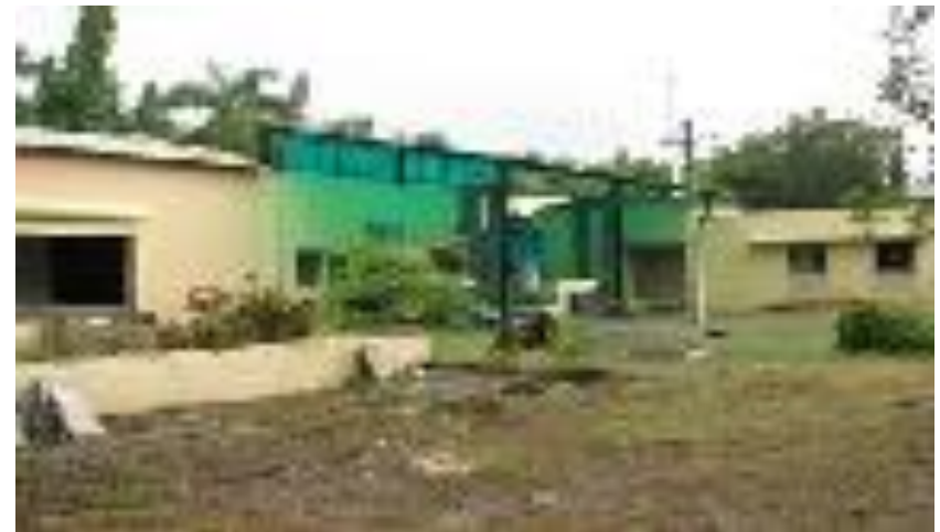
Fruit processing plant