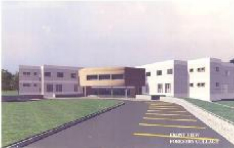
College of Forestry