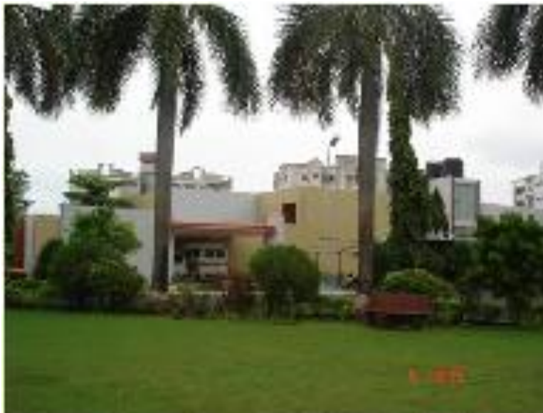
New Guest House