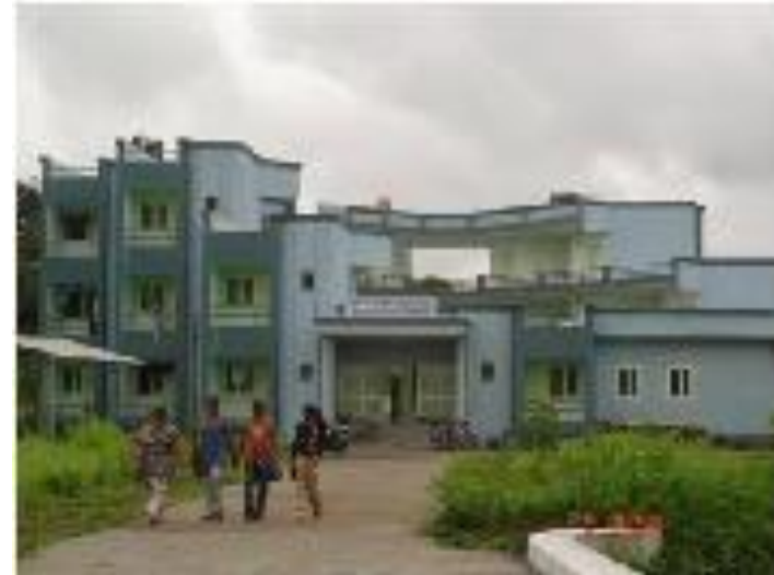
New Girls Hostel - 2