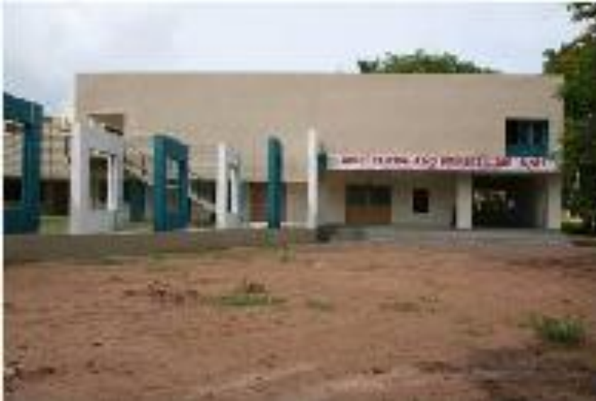
Bio Pesticide and Bio fertilizer Unit