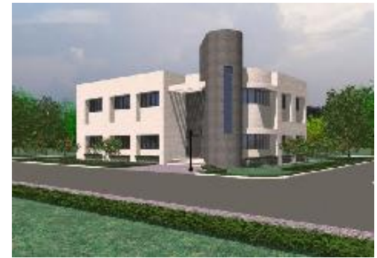
Mega Seed Project