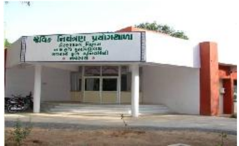
Bio control Laboratory