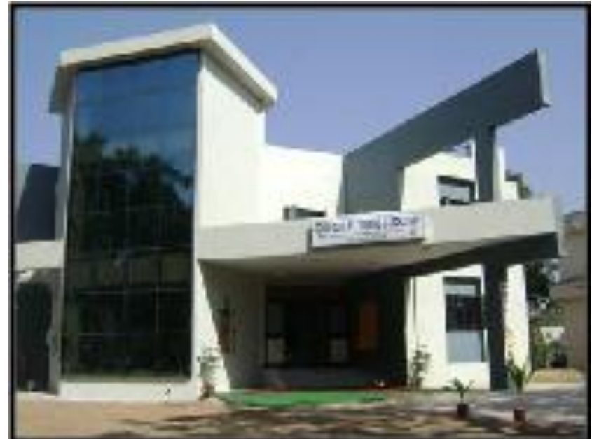
Food Quality Testing Laboratory